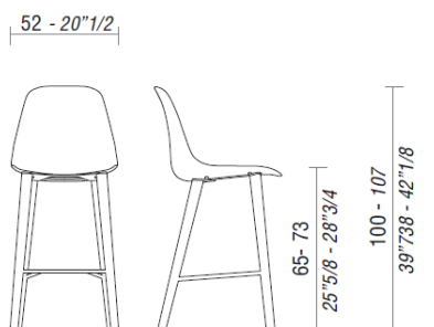
POLA, 4 wooden legs stool.