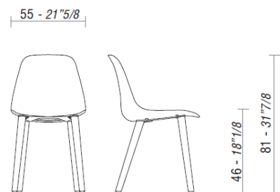
POLA, 4 wooden legs chair.